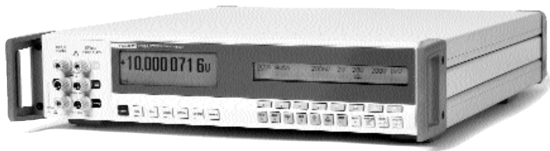
The Fluke 8508A and 8508A-SPRT Standard Platinum Resistance Thermometer